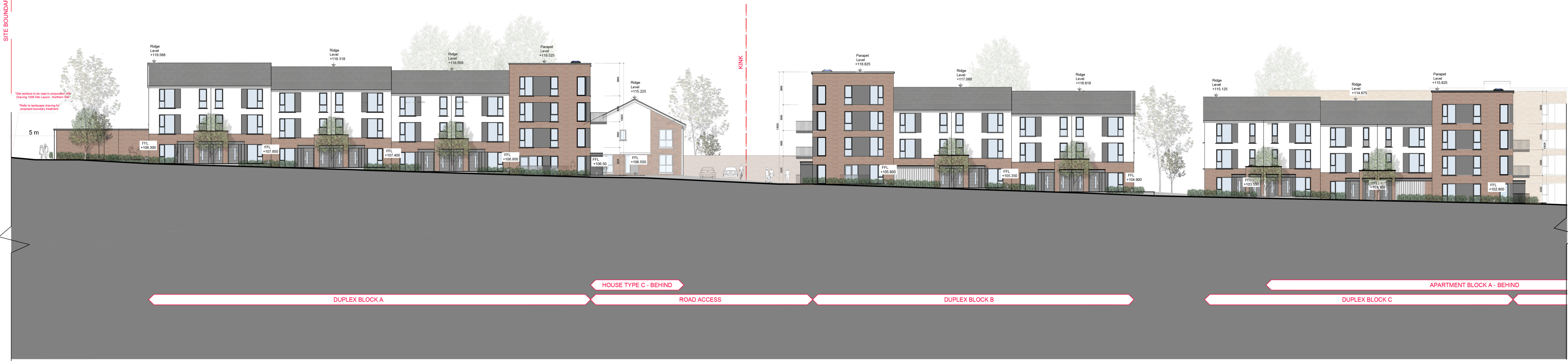
SECTION A-A 1:200 @ A0