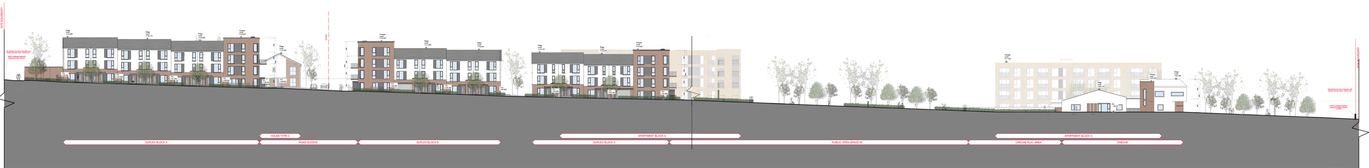
SECTION A-A 1:500 @ A1